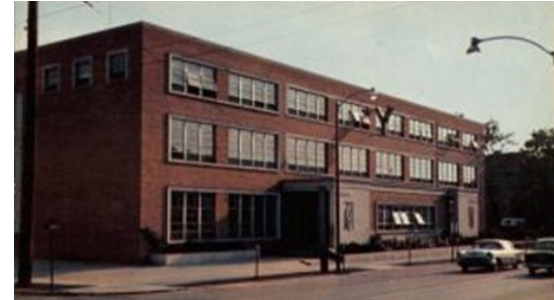
1953 Site of second Marion Family YMCA on Church Street