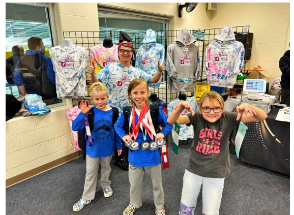
2023 Northwest Ohio YMCA Winter Swim League Championship Meet

The beginning level of the Swim Team where special attention is placed on building the young swimmer's positive attitude towards themselves and the sport through emphasis on teamwork, individual skills, techniques, and sportsmanship. The swimmers are introduced to goal setting as the season progresses. Our goal with the bronze level is to see each young beginner athlete achieve his or her maximum capability.