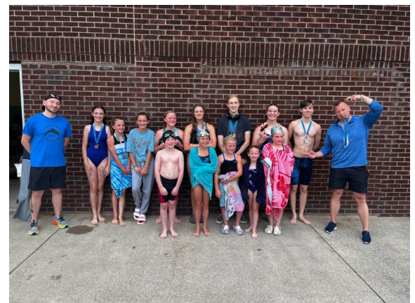
2023 Mid-Ohio YMCA Summer Swim League Championship Meet