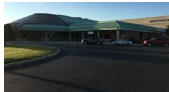
2004 Current Marion Family YMCA on Barks Road